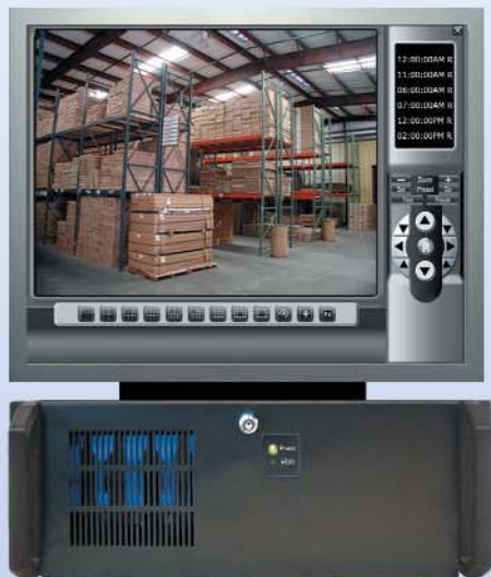
Analog DVR 64CH CIF, 2CIF, D1