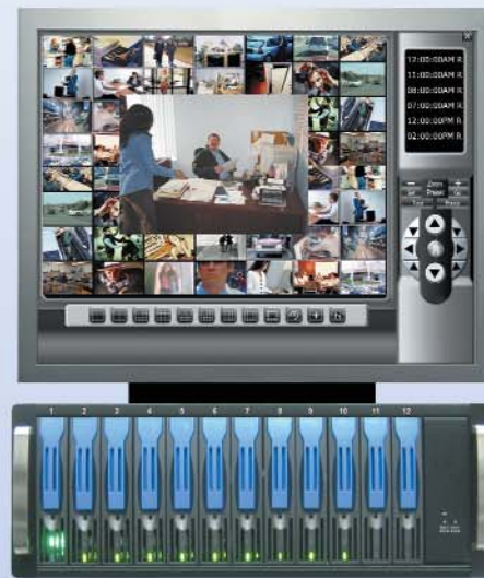
True 64CH NVR IP & MegaPixel