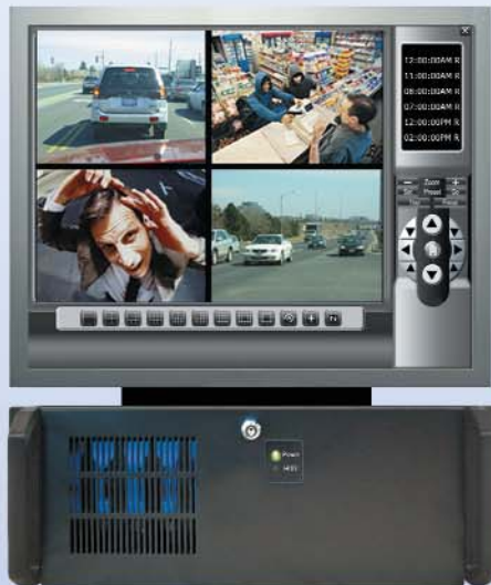
Hybrid N DVR Analog & IP