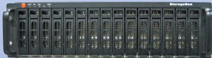
Network Attached storage system